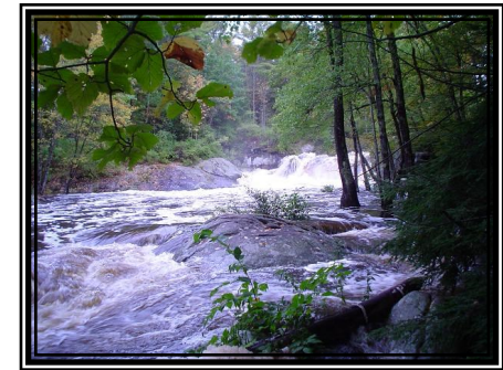
Isinglass River, Barrington, NH

The Isinglass Award promotes teen reading by inviting teens to help select great literature.